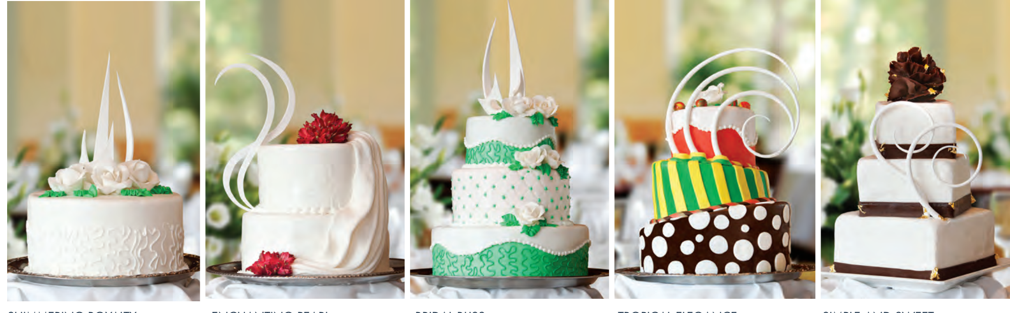
SHIMMERING ROYALTY $7 (up to 25 guests)

Vanilla, Chocolate, Mocha, Coffee, Caramel, Pistachio, Strawberry, Raspberry, Blueberry, Orange, Lemon, Pineapple